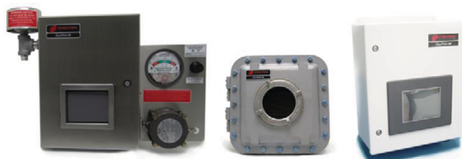
Zpurge Unit Class I, Division 2