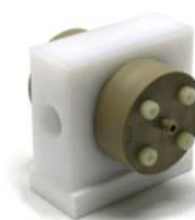
PFA PEEK Flow Cell