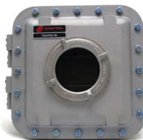
ClearView db ExProof Unit