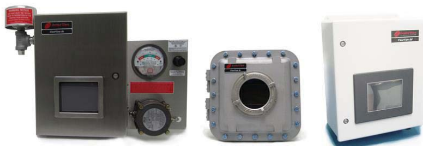
Zpurge Unit Class I, Division 2

Spectra were taken with an InGaAs diode array spectrometer and low-OH optical fibers. Thirteen samples were analyzed at 50°C in a 5 mm quartz cuvette.