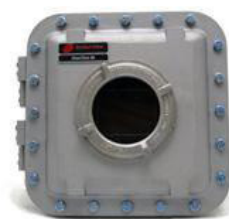
ExProof Unit Class I, Division 1