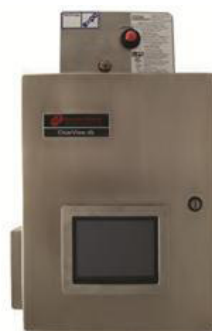
Zpurge Unit Class I, Division 2