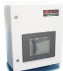
General Purpose Unit