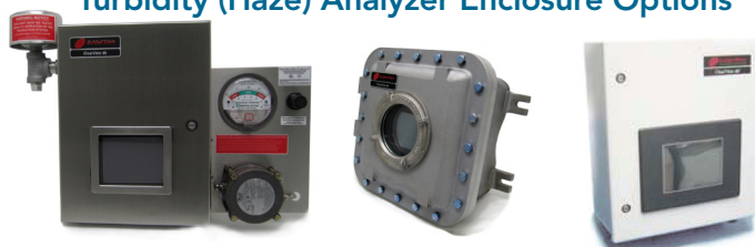
Z-Purge Unit Class I, Division 2