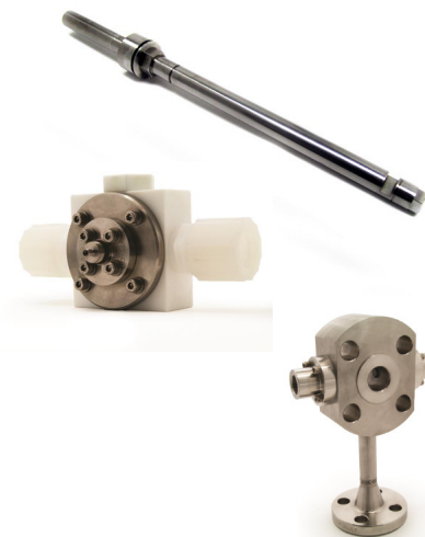
Guided Wave Probes and Flow Cells