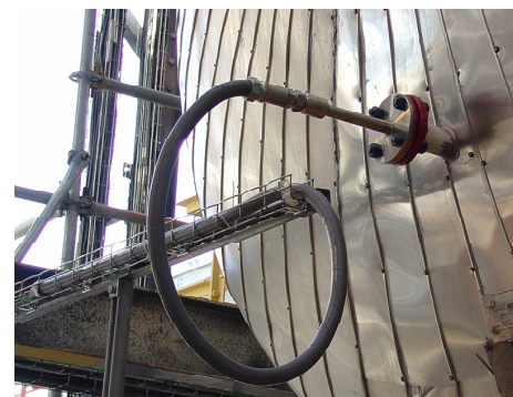
Guided Wave Fiber Optic Insertion Probes Measure Directly in the Reactor

Our insertion probes and flow cells can be connected to our analyzers up to 100 meters away using reinforced process-ready optical fiber cables. Fiber optic cables are routed to the analyzer in the control room or to a suitable enclosure that meets your local safety requirements, such as ATEX.