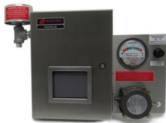
Z-purge Unit Class I, Division 2