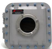
ExProof Unit Class I, Division 1