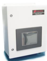
General Purpose Unit