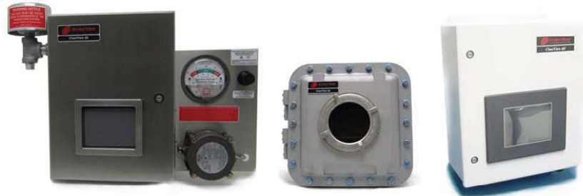
Zpurge Unit Class I, Division 2