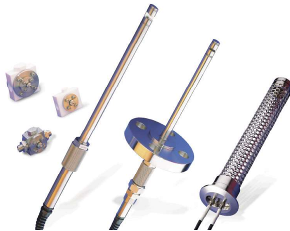
Probes and Gas Flow Cells